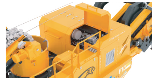
Easy access to the engine compartment.