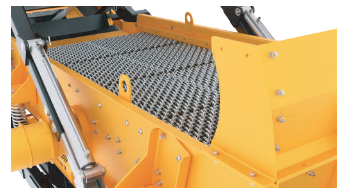
Durable screen sheet and replaceable screen meshes provide high resistance to vibration.