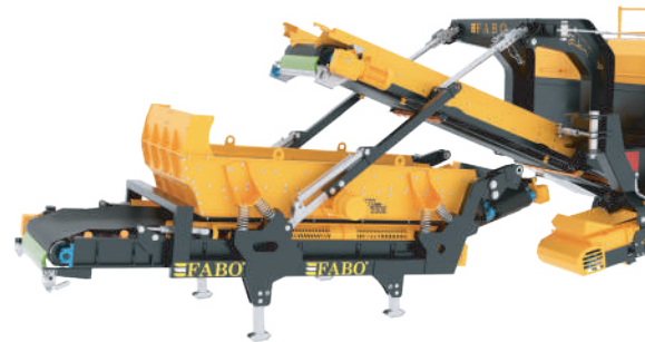
It has a compact design with a front screen that can be easily removed and installed.