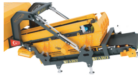
Integrated screening system