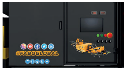
User-friendly PLC control system with a color display