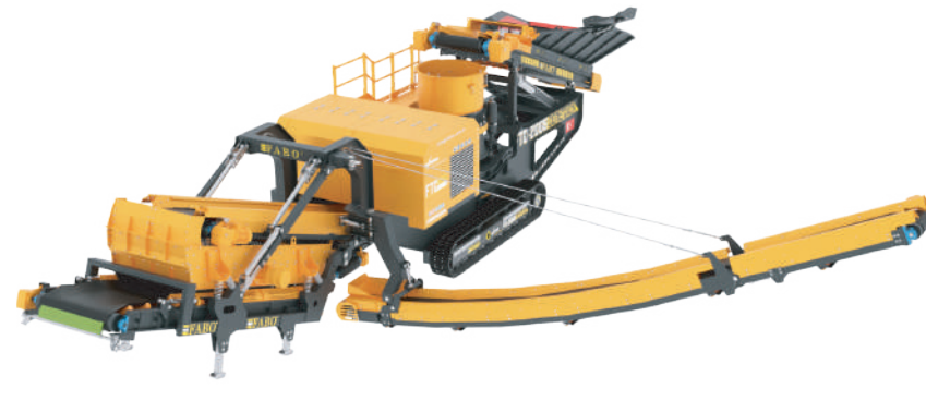
The belt that can rotate 90 degrees can be used as a return belt and also serves as a stock belt.