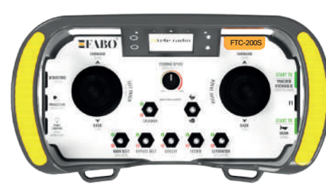
Remote control operation